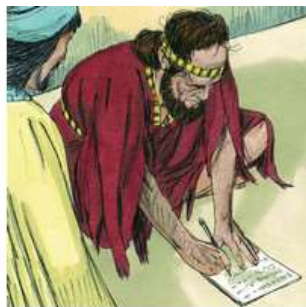
Mordecai sends word to Esther