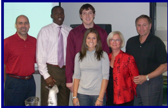
At the October Strategic Development meeting at LETU's Dallas campus